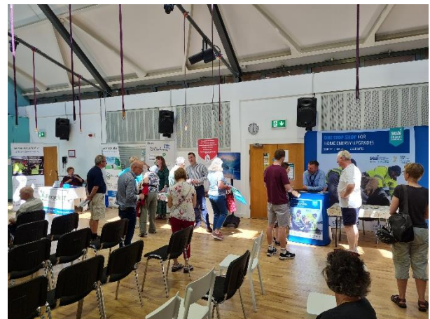
Figure 1 Ballyroan 2023 - South Dublin Community Sustainability Event