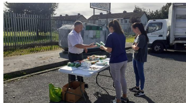
Figure 2 Lucan 2023 - South Dublin County Council Information Sharing @ Mattress Recycling