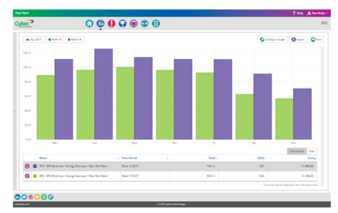
Main meter data before and after PRV Installation