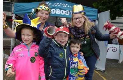
Fig 5: ReCreate @ Croke Park Sustainability Day 2017