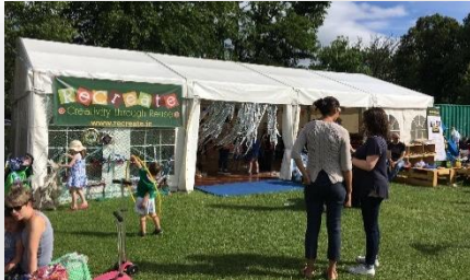
Fig 4: ReCreate At The Rose Festival 2017

that they will divert over 250 tonnes from landfill in 2017, this figure could be extended if the ReCreate Team could measure the effect they have on people that attend ReCreate workshops throughout any given year. By promoting the benefits of reusing materials, it is hoped that this is carried forward to when at home or back in the classroom. Staff are confident a considerable additional tonnage of materials will be diverted from landfill by families and member groups through their own efforts and by seeing how everyday materials can be reused in many different ways.