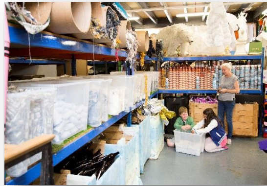
Fig 1: Exploring the possibilities at the Warehouse of Wonders

ReCreate is a thriving social enterprise making art materials and educational supplies affordable and accessible to every sector of the community for all kinds of creative purposes. This is achieved by salvaging clean, reusable materials from business and distributing them to members for free in unlimited quantities. The project is based on a concept known as Creative Reuse which encourages the public to reuse materials that would normally be sent to landfill or for recycling, for all manner of creative and inventive purposes.